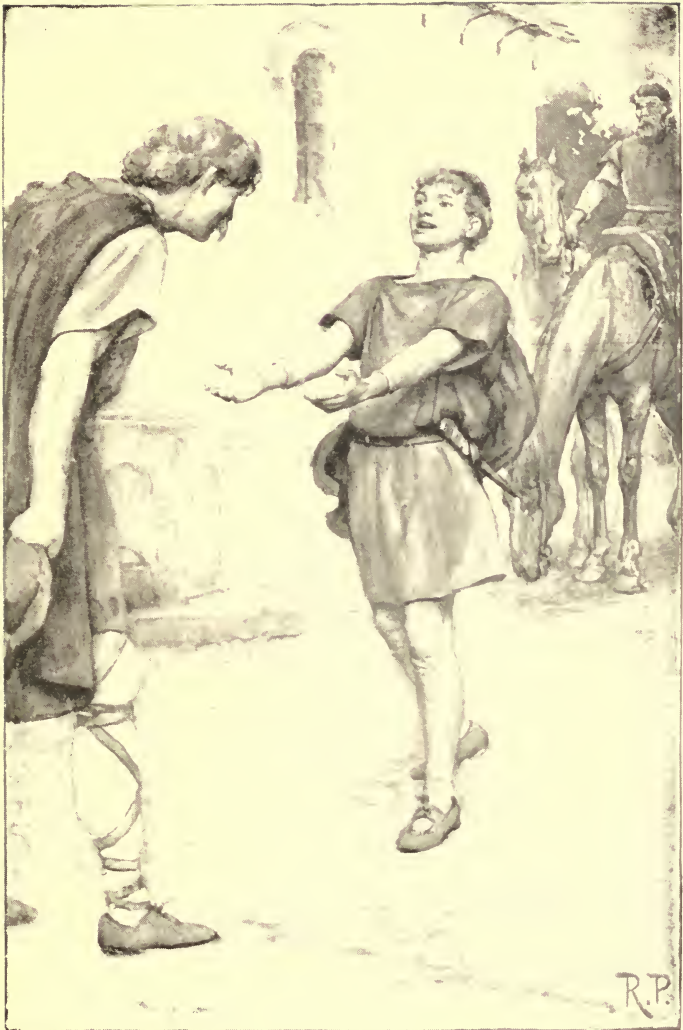
THE YOUNG THANE COMES BACK TO STEYNING